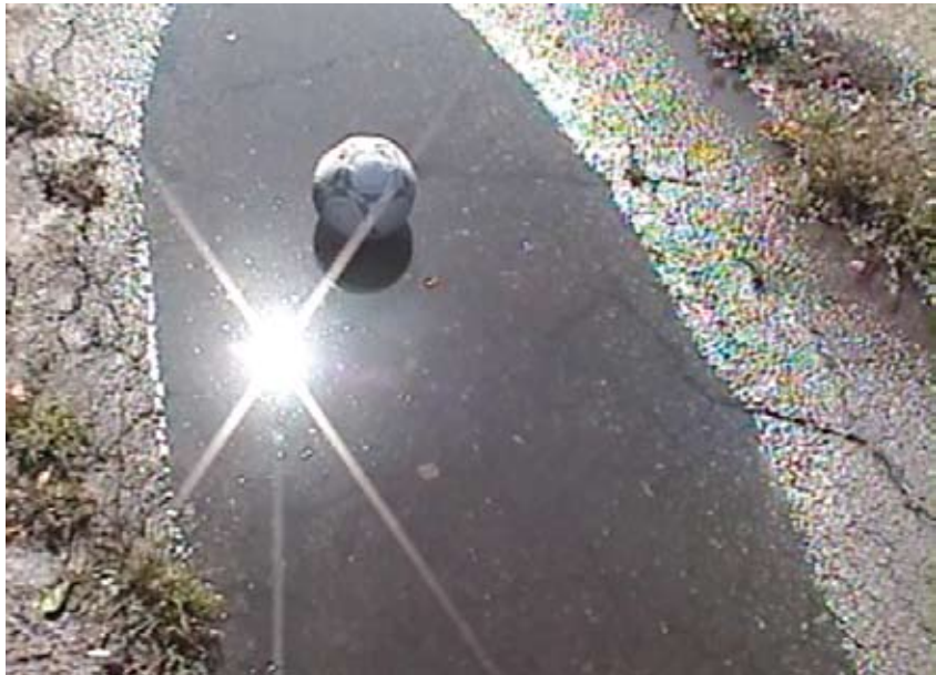
Euan Macdonald, Eclipse , 2000. Video loop, 2:25 min. Courtesy of Birch Libralato, Toronto.