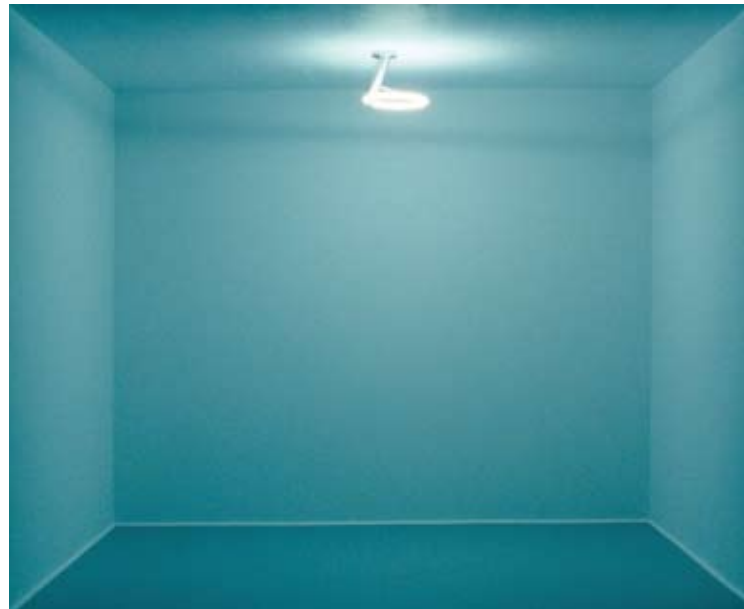
Christian Giroux and Daniel Young, 50 Light Fixtures from Home Depot , 2009. 35mm colour motion picture film loop, silent, 13:00 min.