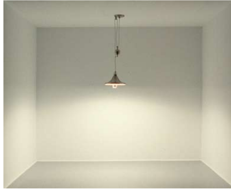
Christian Giroux and Daniel Young, 50 Light Fixtures from Home Depot , 2009. 35mm colour motion picture film loop, silent, 13:00 min. Courtesy of the artists.