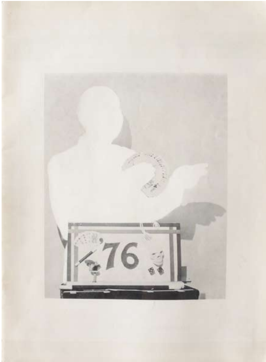
Will Rogan, Silencer (MUM) , 2007. Altered magazine page, 11.125 x 8.25 in.